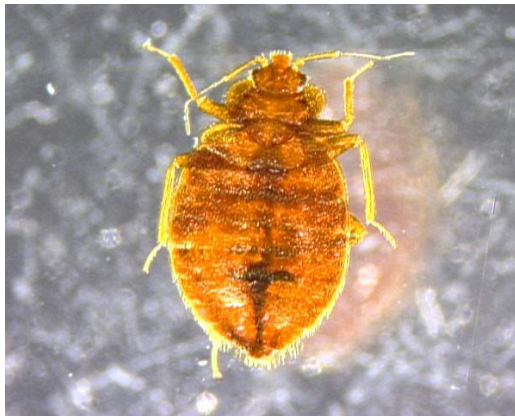
The common bed bug, Cimex lectularius L.

MP3 Files--To listen and view these files you will need a software program capable of loading these files or you can download the program for free from Microsoft Windows Media Player .