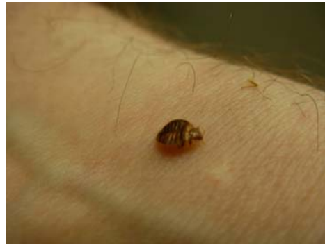
Bed bug fecal spots Bed bug on arm (size, ¼ inch)

Feeding occurs before each molt and before reproduction.