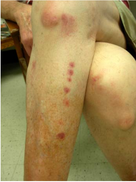
A common skin reaction to bed bug bites. Note how the bites are in a row